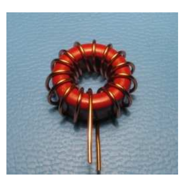
L5 and L6, 15 turns