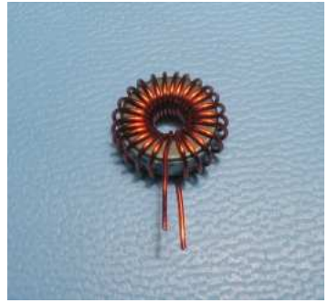
T1 and T2, 25 turns

Amidon toroidal core (color black) FT-37-61 in Rev A and FT-50-61 in Rev B Enamel copper wire, diameter 0.4 mm (AVG26) Approx wire length 25 mm per turn