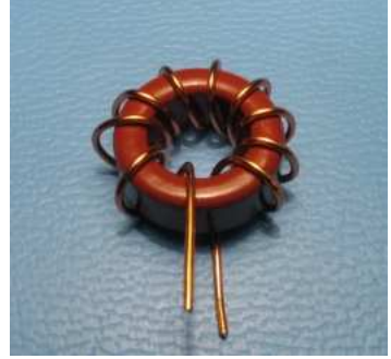
L9 and L10, 10 turns