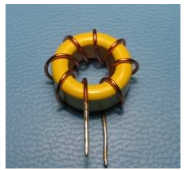
L11 and L12, 8 turns

Red toroidal cores Amidon T-50-2 Yellow toroidal cores Amidon T-50-6 Enamel copper wire, diameter 0.6 mm (AVG22) Approx wire length 25 mm per turn