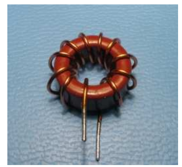
L7 and L8, 11 turns