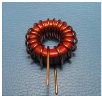
L3 and L4, 19 turns