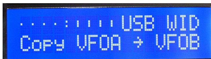
Split Mode Copy, VFOA to VFOB

To copy the VFO-A frequency to VFO-B, select VFO A, and press and hold the VFO button until you hear a long beep, and the display will show: