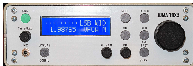
Fixed Resolution – 10Hz

The display is fixed at 10Hz resolution, independent of the tuning rate used.