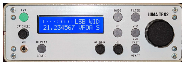
Slow Tuning Rate – 1Hz

The frequency will be displayed depending upon the tuning rate being used, thus: