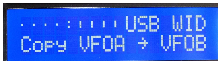
Split Mode Copy, VFOA to VFOB

To copy the VFO-A frequency to VFO-B, select VFO A, and press and hold the VFO button until you hear a long beep, and the display will show: