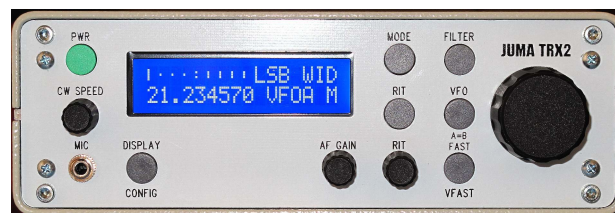
Medium Tuning Rate – 10Hz