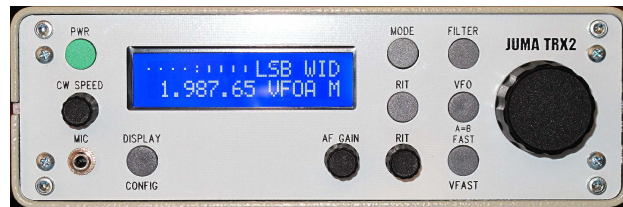
Original Frequency Display