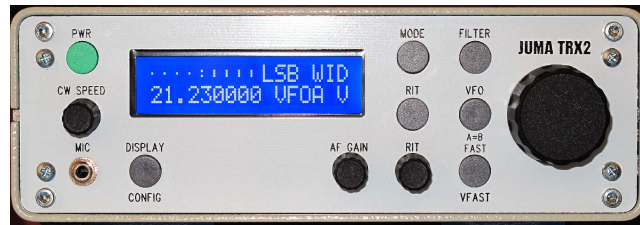
Very Fast Tuning Rate – 10kHz

Note that the precision is not affected, the frequency is rounded to the appropriate tuning rate's resolution if this mode is selected in the User Configuration menu.