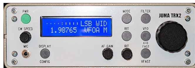
Fixed Resolution – 10Hz

The display is fixed at 10Hz resolution, independent of the tuning rate used.