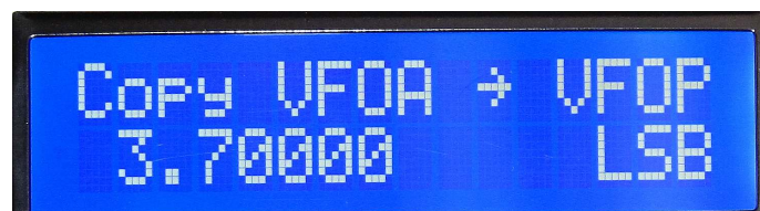
Copy VFO-A to VFO-P

This function allows you to copy the contents of any active VFO to the User VFO Memory bank.