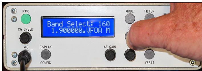
Rapid Band Select In Use

A long push of this button will invoke the Rapid Band Selection feature.