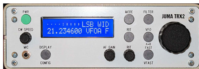
Fast Tuning Rate – 100Hz