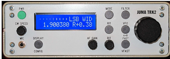
Frequency Display Including RIT Offset

A long push of this button will invoke the Rapid Band Selection feature.