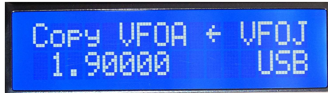
Copy VFO memory J to active VFOA

To copy from the active VFO to a memory, rotate the VFO knob clockwise, the direction arrow will point right, and the right-hand VFO memory designator will increment. In the example above, the active VFO is A, whose frequency and mode are displayed on the lower line, and is being copied to VFO memory P.