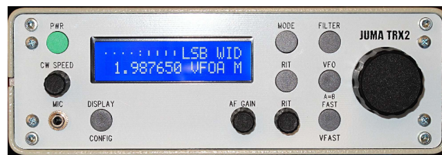
Fixed Resolution – 1Hz

The display is fixed at 1Hz resolution independent of the tuning rate used. For frequencies below 1MHz the decimal point will move to the kHz position, and no leading zeros are used. (See note 6 at the end of this document.)