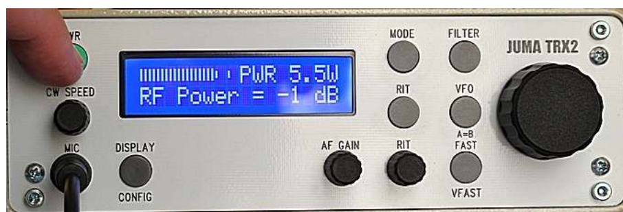
TX Attenuator Adjustment

This attenuator selection feature is enabled by setting the mode to TUNE, pressing and holding the PTT switch, and then holding the PWR button down. The display will then change and will appear as below.