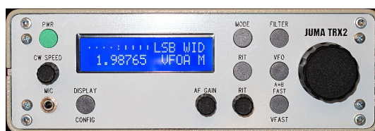
Fixed Resolution – 10Hz

The display is fixed at 10Hz resolution, independent of the tuning rate used.