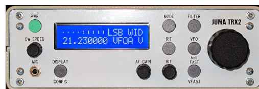
Very Fast Tuning Rate – 10kHz