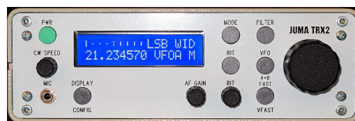
Medium Tuning Rate – 10Hz