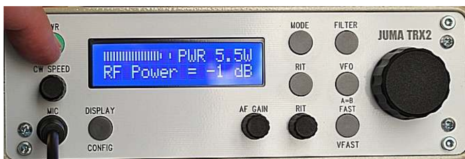
TX Attenuator Adjustment

This attenuator selection feature is enabled by setting the mode to TUNE, pressing and holding the PTT switch, and then holding the PWR button down. The display will then change and will appear as below.