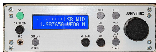
Fixed Resolution – 1Hz

The display is fixed at 1Hz resolution independent of the tuning rate used. For frequencies below 1MHz the decimal point will move to the kHz position, and no leading zeros are used. (See note 6 at the end of this document.)