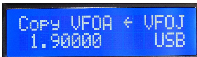
Copy VFO memory J to active VFOA

To copy from the active VFO to a memory, rotate the VFO knob clockwise, the direction arrow will point right, and the right-hand VFO memory designator will increment. In the example above, the active VFO is A, whose frequency and mode are displayed on the lower line, and is being copied to VFO memory P.