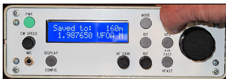
Saving A Frequency To A User Band

A long press of the button will store the currently displayed frequency and mode into the user band memory. There are 9 such memories, one for each amateur band, and they are selected by the Rapid Band Switch feature assigned as a secondary function of the RIT button.