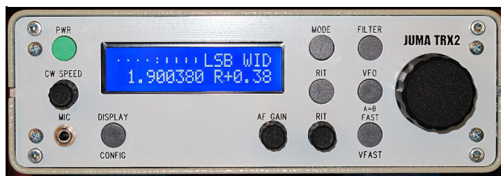
Frequency Display Including RIT Offset

If the Include RIT feature is enabled in the User Setup, then the frequency display will show the actual receiver frequency including the RIT shift.