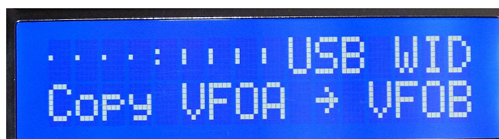
Split Mode Copy, VFOA to VFOB

To copy the VFO-A frequency to VFO-B, select VFO A, and press and hold the VFO button until you hear a long beep, and the display will show: