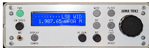
Original Frequency Display