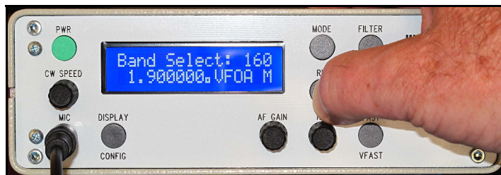
Rapid Band Select In Use

A long push of this button will invoke the Rapid Band Selection feature.