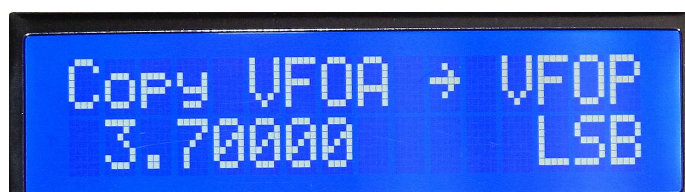
Copy VFO-A to VFO-P

This function allows you to copy the contents of any active VFO to the User VFO Memory bank.