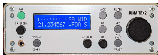
Slow Tuning Rate – 1Hz

The frequency will be displayed depending upon the tuning rate being used, thus: