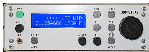
Fast Tuning Rate – 100Hz